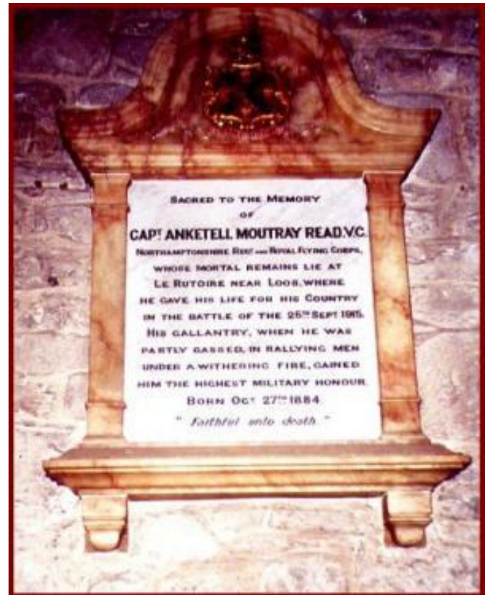
Memorial in Bampton Church, Devon